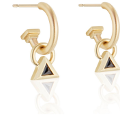
Tiny Hoops with Foundation Drops, Single/Pair, 14K YG White Diamond $380/$760 Black Diamond $345/$690