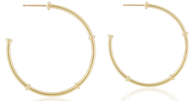
Auspicious Hoops, Grand 35mm, 14K YG $704.54