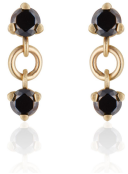
Auspicious Duo Gemstone Drops, 4mm, Single/Pair 14K YG Black Spinel $165/$330 White Sapphire $188.50/$377 Birthstones $160/$320