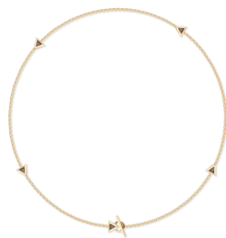
Foundation Five Station Collar, Toggle, 14 -16 Inches, 14K YG White Diamond Pave $955 White Diamond Trillion $1015 Black Diamond Trillion $970