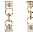
Foundation Asymmetrical Drops Single/Pair, 14K YG, White Sapphire/White Diamond Pave $255.68/$511.36 Black Diamond/Black Spinel $260/$520