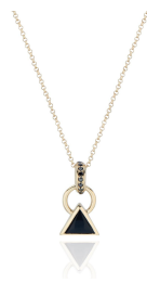
Foundation Pendant S Clasp, 16 - 20 Inches 14K YG Onyx/Black Diamond $945