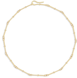
Permanence Chain Bead + Hook Clasp, 14K YG 16" $1295.45 18" $1409 20" $1590 24" $1659 30" $1840.90