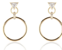
Foundation Hoop Earrings, Grand, 14K YG White Sapphire/White Diamond $1800