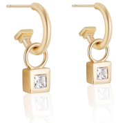
Tiny Hoops with Square Drops, Single/Pair, 14K YG White, Green, Blue, Yellow or Pink Sapphire $375/$750 Black Diamond $340/$680