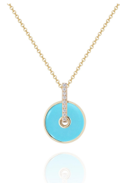
Outline Pendant 14K YG Turquoise/White Diamond $1282