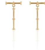
Perpendicular Earrings, Petite, 1.5 Inches 14K YG $406