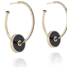
Outline Hoops, Grand 14K YG Onyx/Black Diamond $2300