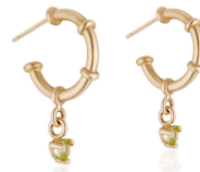
Auspicious Gemstone Drop Hoops, Tiny, 10mm, 14K YG White Diamond $540 Black Diamond/Birthstone $520