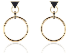
Foundation Hoop Earrings, Grand, 14K YG Onyx/Black Diamond $1050