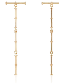
Perpendicular Earrings, Grand, 3 Inches 14K YG $800