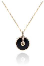
Outline Pendant 14K YG Onyx/Black Diamond $1150

COLLECTION II takes further inspiration from the Art Deco era with an updated color palette of turquoise, citrine, onyx, moss agate and grey moonstone, sprinkled with pavé diamonds in swingy, graphic silhouettes.