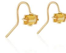
Endless Baguette Drop Earrings 6mm x 4mm, 14K YG Citrine, Grey Moonstone, Rose Quartz or Onyx $375