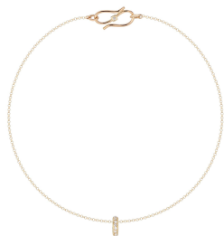
Endless Pendant Pave Bail, S Clasp 16 - 20 Inches, 14K YG Black Diamond $675 White Diamond $675

COLLECTION I takes inspiration from the bold, geometric patterns of Art Deco era textiles. Bezel set or pavé diamond trillions mix with onyx, rock crystal, moss agate, citrine and amethyst, treated likewise as precious in yellow gold.