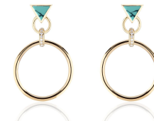
Foundation Hoop Earrings, Grand, 14K YG Turquoise/White Diamond $1225