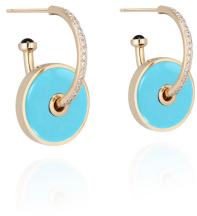
Outline Hoops, Petite 14K YG Turquoise/White Diamond $2055