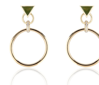
Foundation Hoop Earrings, Grand, 14K YG Moss Agate/White Diamond $1200