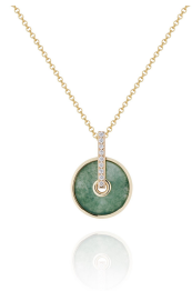
Outline Pendant 14K YG Moss Agate/White Diamond $1270.45