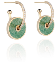
Outline Hoops, Petite 14K YG Moss Agate/White Diamond $2055