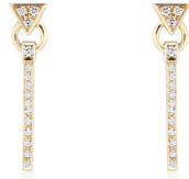
Foundation Line Drops White Diamond Pave, Full 14K YG $900