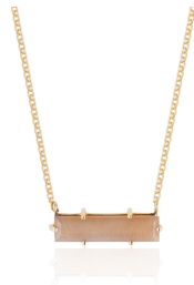
Endless Baguette Pendant 16 - 20 Inches, S Clasp .9mm Cable Chain 14K YG Citrine, Grey Moonstone, or Onyx $370