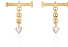
Permanence Gemstone Chain Drops, Single/Pair, 14K YG Birthstones $162/$324 White Diamond $172/$344