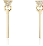
Foundation Line Drops White Diamond Pave, Top 14K YG $725