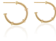
Auspicious Hoops, Petite 15mm, 14K YG $477