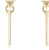
Foundation Line Drops Bezel Set Trillion, 14K YG White Diamond $760 Black Diamond $650