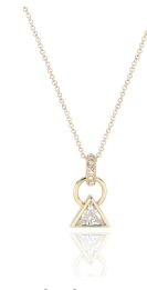
Foundation Pendant S Clasp, 16 - 20 Inches 14K YG White Sapphire/White Diamond $1180