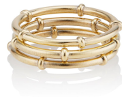
Auspicious Stacking Rings Single/Set of 3 14K YG $160/$490